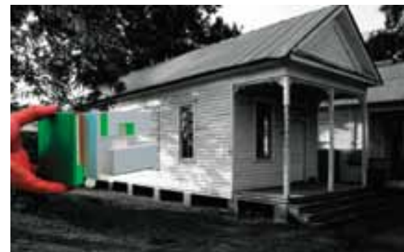
Existing Row House project.