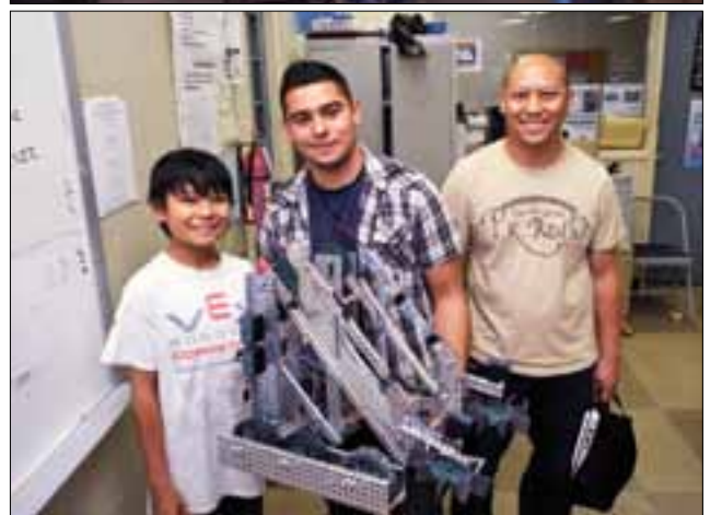
BUILDING A CULTURE OF EXCITEMENT: Rice students work with local high school students to build a robot.