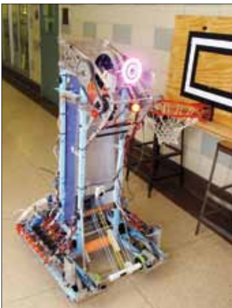
A WINNING DESIGN: A robot that can shoot hoops.

high schools from across Texas and won the regional event. Over the last four years, the team, known as the Discobots, has won the Houston Regional competition.