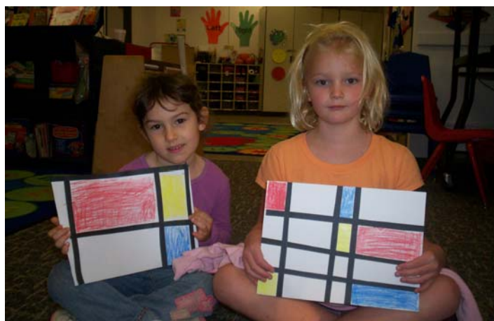
Figure 4. Two students share their Mondrian-like masterpieces.

color to make their work of art the most aesthetically pleasing. Students quickly set to the task, creating their Mondrian-like masterpieces, and then sharing their finished products with the class (figure 4). In a follow-up activity, students then observed and counted the number of square and rectangular regions in their works. The kindergartners' Mondrian masterpieces were mounted in a rectangular array on a classroom wall, reminding students of the integrated mathematics-art activity in which they engaged and how shapes are used in art.