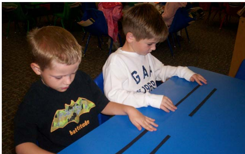
Figure 2. Students position strips of black construction paper to form horizontal lines.

Students then viewed several images of paintings in Mondrian's Composition series and were encouraged to articulate the shapes they saw (squares and rectangles) in his work and how the primary colors (red, blue, and yellow) were used. Students were given an 8.5” X 11” piece of white posterboard, gluesticks, as well as additional strips of black construction paper and were asked to create a work of art in the spirit of Mondrian by placing and then gluing horizontal and vertical strips on their posterboard (figure 3) and then deciding which squares and rectangles they should