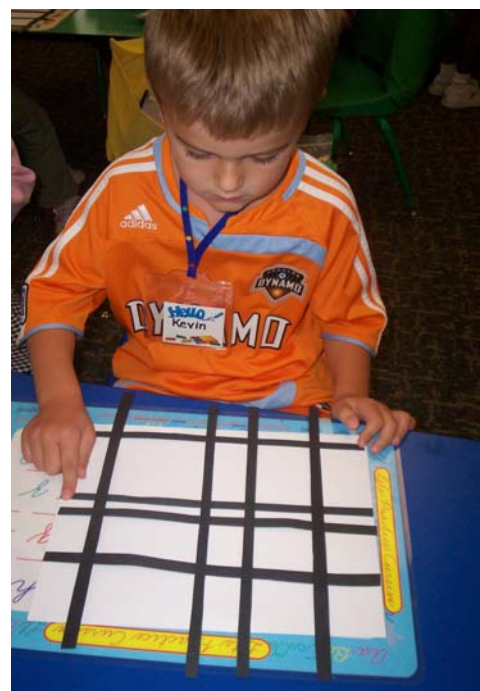
Figure 3. A kindergartner positions strips of black construction paper horizontally and vertically.

color to make their work of art the most aesthetically pleasing. Students quickly set to the task, creating their Mondrian-like masterpieces, and then sharing their finished products with the class (figure 4). In a follow-up activity, students then observed and counted the number of square and rectangular regions in their works. The kindergartners' Mondrian masterpieces were mounted in a rectangular array on a classroom wall, reminding students of the integrated mathematics-art activity in which they engaged and how shapes are used in art.