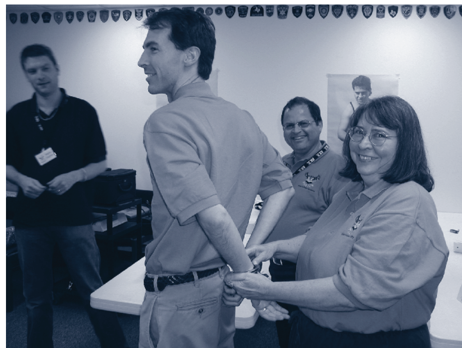
Students at the Citizens Police Academy receive hands-on training on the finer points of handcuffing a suspect.

"I DIDN'T WANT TO MISS A NIGHT BECAUSE I THOUGHT I MIGHT MISS SOMETHING IMPORTANT."