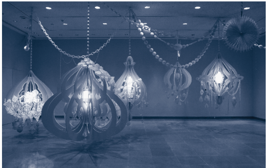
The “Dans la Lune” exhibition currently on display at the Rice Gallery features ethereal paper sculptures that invite viewers into a world of beautiful excess.