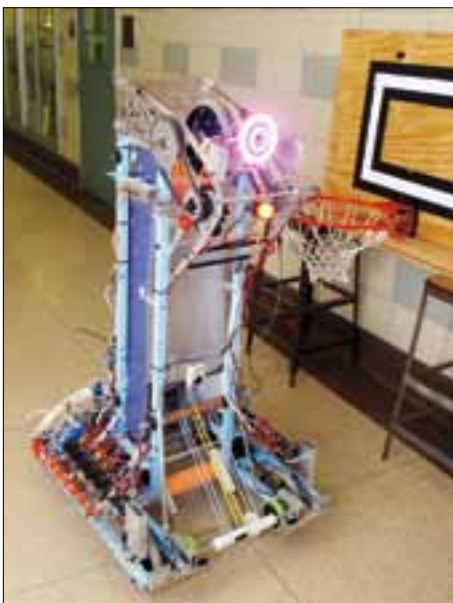
A WINNING DESIGN: A robot that can shoot hoops.

high schools from across Texas and won the regional event. Over the last four years, the team, known as the Discobots, has won the Houston Regional competition.