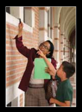
PAGE 4: Rice develops leaders in mathematics