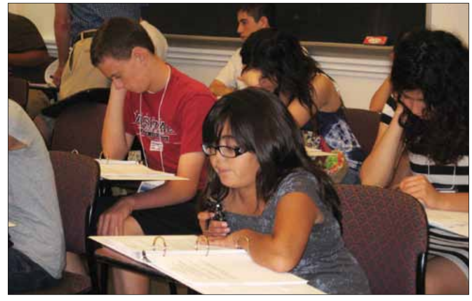
APPLYING THEMSELVES: Local high schools learn about global issues, college admission and the application process

Marketing Specialist Glasscock School of Continuing Studies