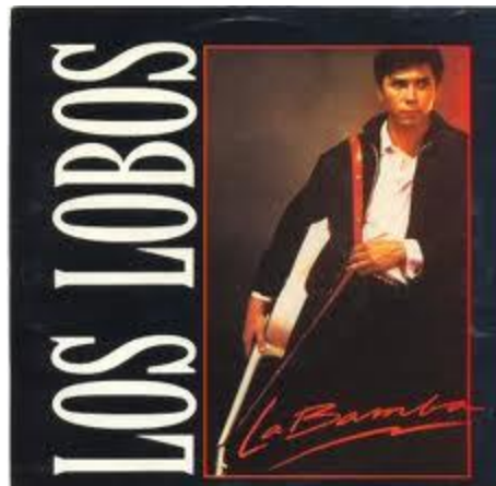
La Bamba by Los Lobos