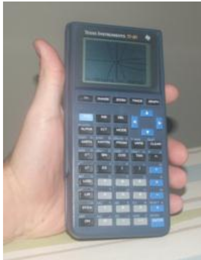
TI-81 graphing calculator

RUSMP started 3 years before the development of this tool that has dramatically changed the teaching of algebra across the country.