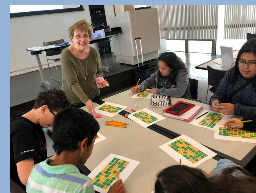
Rice University Math Circle