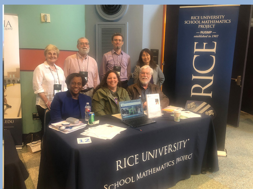
AWM Research Symposium