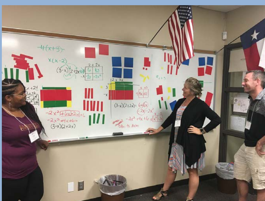
RUSMP Programs for Teachers