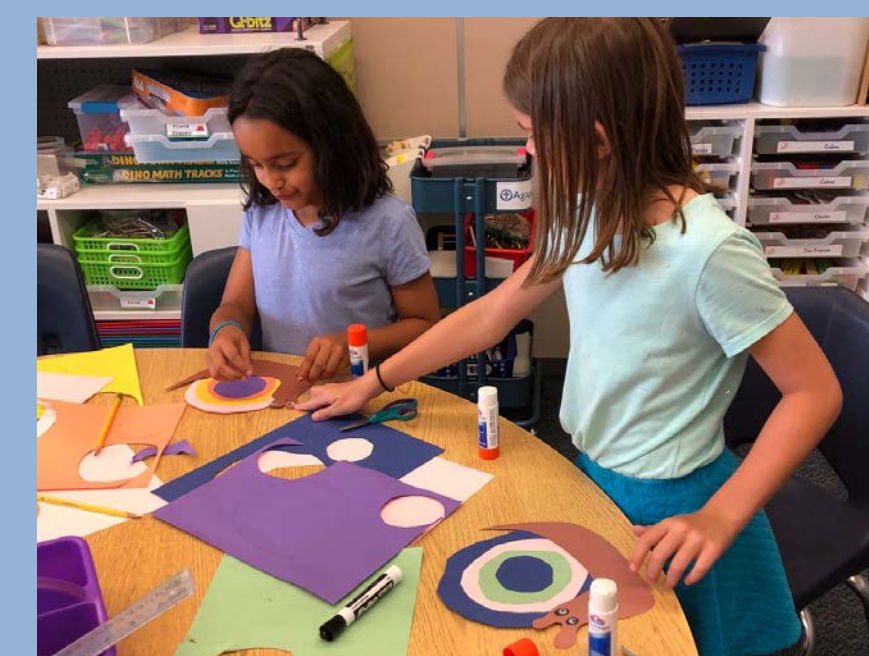
RUSMP Summer Math Camps