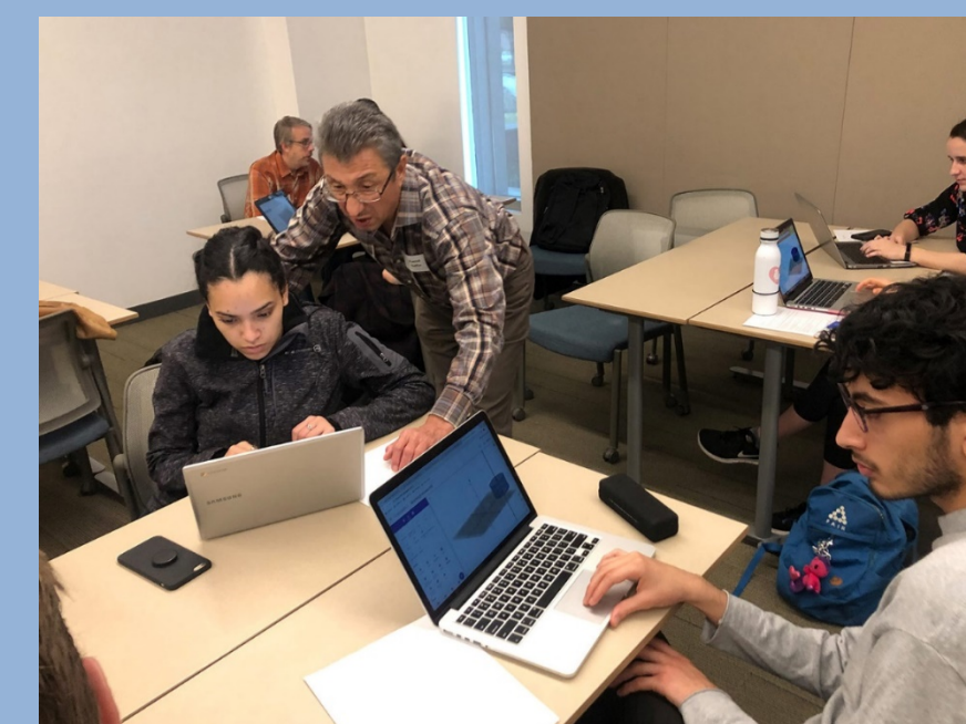
Rice University Life in Schools Conference