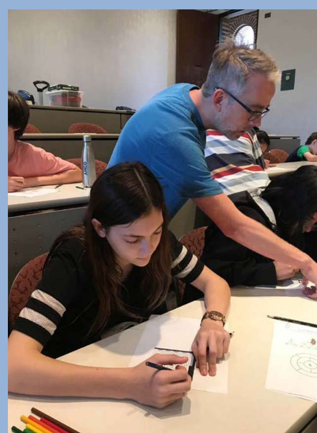
Math-Letics Spring Break Camp